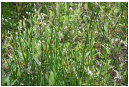
Native sedges in palustrine wetland

An area of "of concern" regional ecosystem, (RE 12.3.8) Palustrine wetland, is located along one of the tributary gullies to Obi Obi Creek which runs through the site, and has been significantly altered and damaged by cattle.