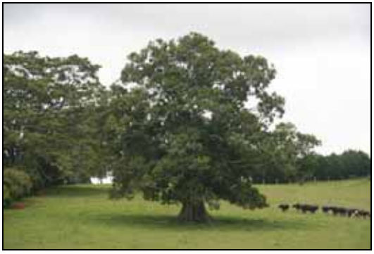
A range of studies recommend that further revegetation works be undertaken on the site.