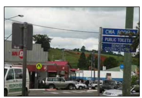
View from Maple St near community centre

The site is not visible from Maple Street, however the Cloudwalk development to the west is.