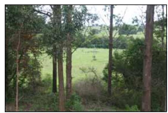
Site as viewed from footpath beside Landsborough-Maleny Road

Closer to Maleny (near the church and retirement village) the road and footpath follow quite closely to the creek and the site is visible through the vegetation, although it is more noticeable to the walker.