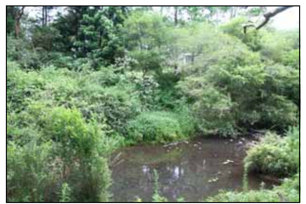
Obi Obi Creek at the south western corner of the site

Obi Obi Creek which runs along the southern perimeter of the site has a severely degraded riparian zone, particularly on the areas within the Maleny Community Precinct site. A number of drainage lines running through the site flow directly into the creek, the majority of which have been denuded of vegetation.