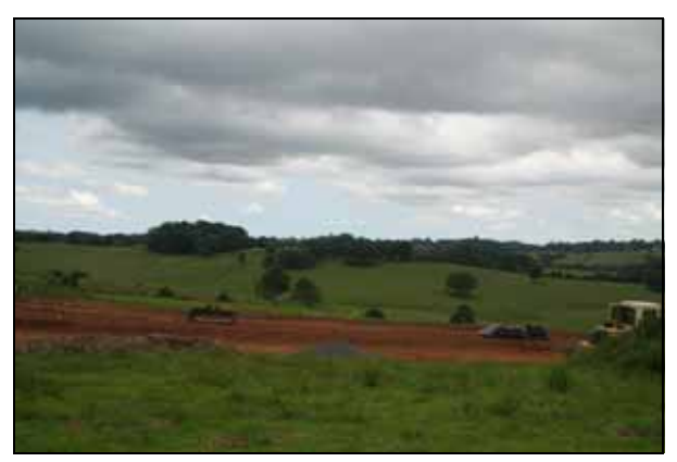
Site as viewed from North Maleny Road with Cloudwalk in foreground

A preliminary review of view lines to and from the site has been undertaken. The majority of the site is highly visible from North Maleny Road (including from the Cloudwalk development) and Obi Obi Lane. (Refer to Map 19 )