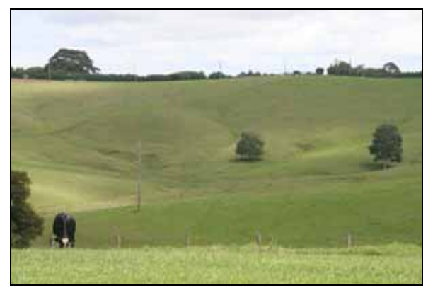
Natural drainage lines on the site