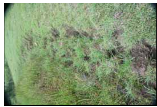
Damage by cattle at edges of wetland