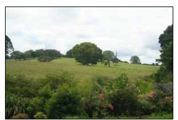
Site as viewed from Bowls Club bottom carpark

There is a clear view of the site from the Maleny Bowls Club green and the Maleny High School on Bunya Street looking north.